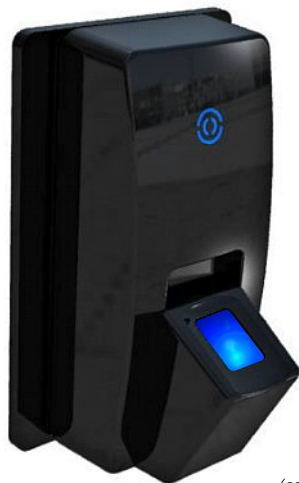
(cover plate with RX6 fitted)