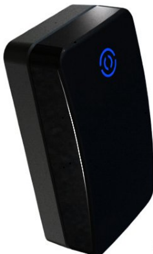
(spacer with RX4 fitted)