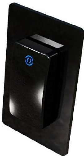
(cover plate with RX4 fitted)