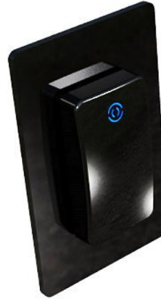
(cover plate with RX4 fitted)

Reader Models are sold as customer-specific configurations.