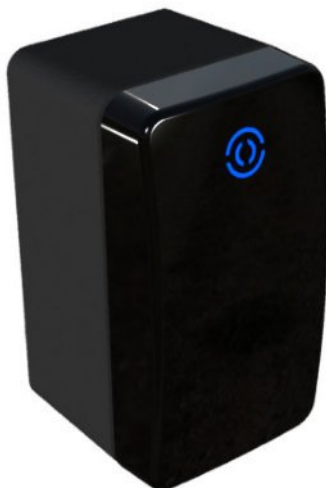
(back box with RX4 fitted)