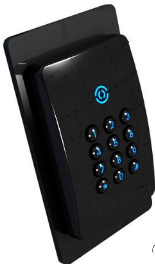
(cover plate with RX3K fitted)