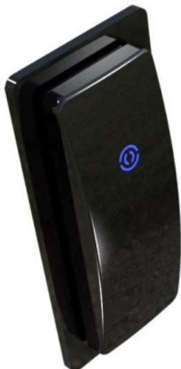
(cover plate with RX2 fitted)