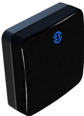
(spacer with RX1 fitted)