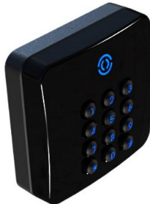
(spacer with RX1K fitted)