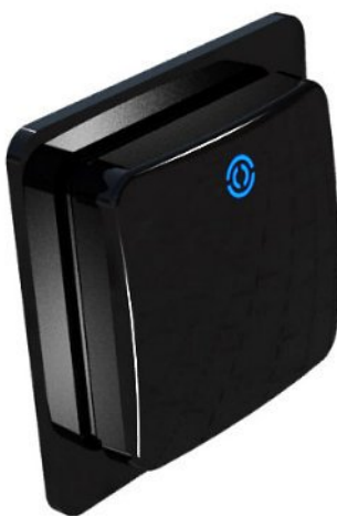
(cover plate with RX1 fitted)