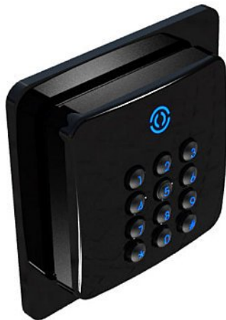
(cover plate with RX1K fitted)