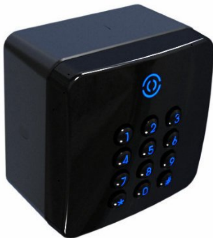
(back box with RX1K fitted)