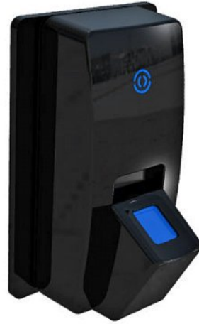
(cover plate with RX6 fitted)

Reader Models are sold as customer-specific configurations.