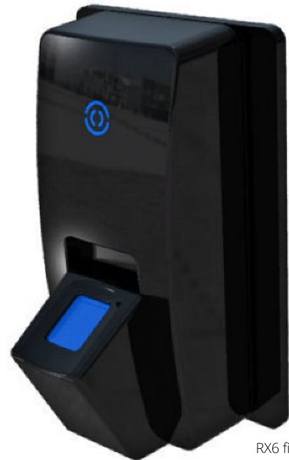
RX6 fixed to cover plate