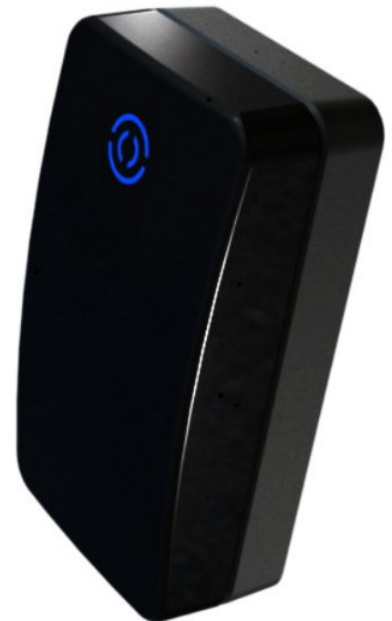
RX4 fixed to SPACER