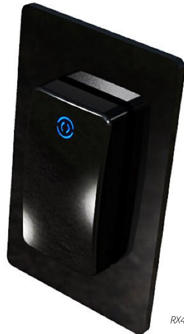
RX4 fixed to cover plate