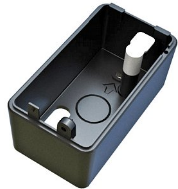
(tamper detection fitted)

Third Millennium has more than 20 years of award-winning experience in the design and manufacture of RFID technology, and the delivery of world class, state-of-the-art access control projects to our many global partners.