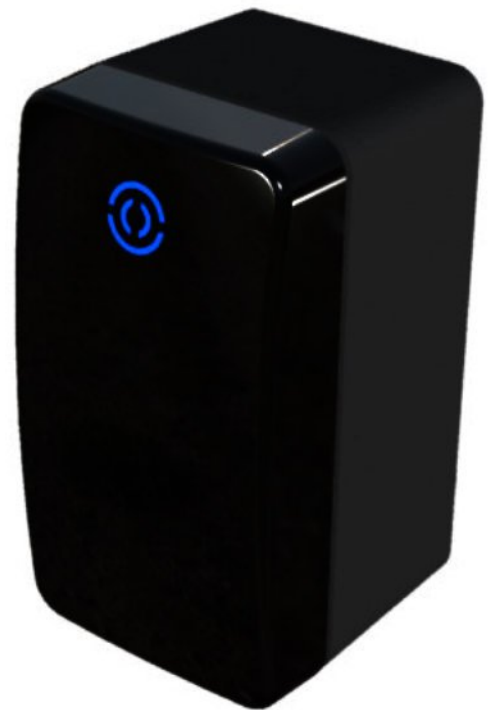
RX4 fixed to BACKBOX