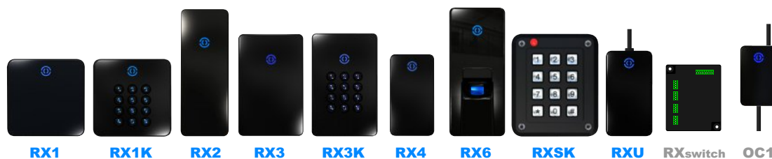
RX1 RX1K RX2 RX3 RX3K RX4 RX6 RXSK RXU RXswitch OC1

Third Millennium Systems Ltd. 18 / 19 Torfaen Business Centre Panteg Way New Inn PONTYPOOL NP4 0LS United Kingdom