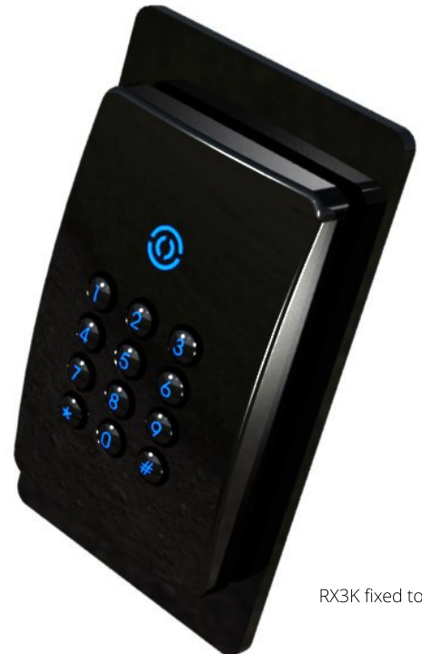
RX3K fixed to cover plate