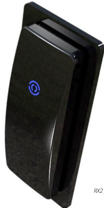
RX2 fixed to cover plate