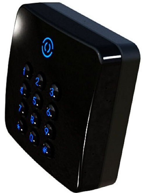
RX1K fixed to SPACER