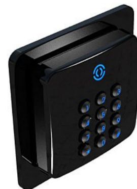
(cover plate with RX1K fitted)