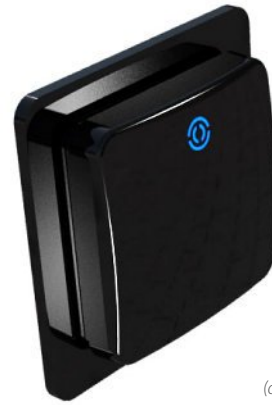
(cover plate with RX1 fitted)

Reader Models are sold as customer-specific configurations.