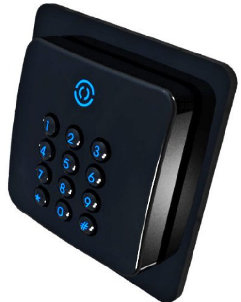
RX1K fixed to cover plate