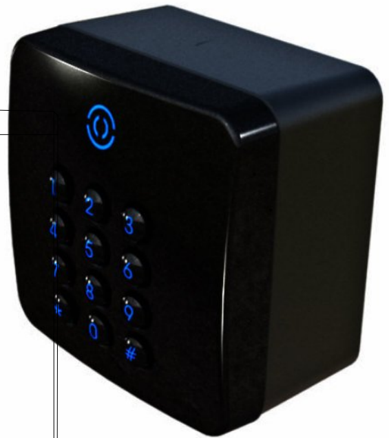
RX1K fixed to BACKBOX